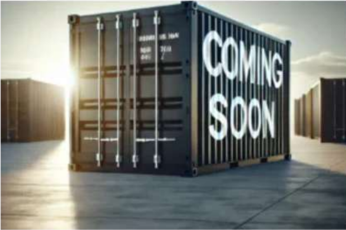
Infinity – Northampton