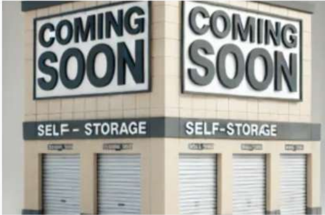
Infinity – Surrey