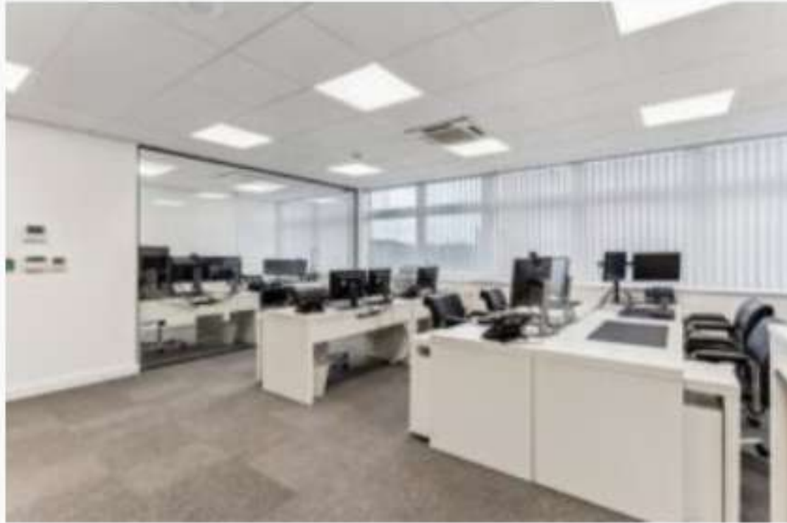
Infinity – Borehamwood